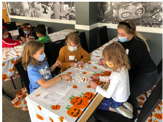
Participants making marshmallow towers

Kids Day Camp was a huge success this semester. We had 14 kids participate and are hoping for an even bigger turnout next semester for our Earth Day themed camp.