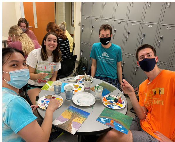
AIChE Members at our Bob Ross Painting Event