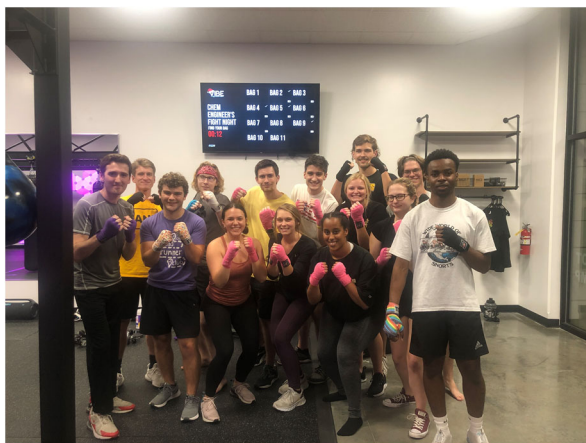
AIChE Members at our Kick Boxing Event