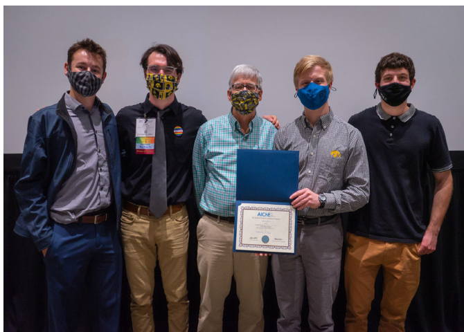
The winning ChemE Jeopardy Team

Iowa looks forward to competing in the regional ChemE Jeopardy competition at Iowa State this upcoming April, where they hope to qualify for the 2022 annual national ChemE Jeopardy competition.