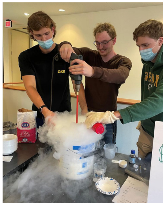
OXE Members making the liquid nitrogen ice cream

OXE; nothing will warm your heart more than giving a kid with a dairy intolerance the chance to enjoy some ice cream! Seeing the smiles of all those kids who typically do not get to enjoy ice cream was the cherry on top and from now on OXE will be sure to always bring the vegan recipe to the Liquid Nitrogen Ice Cream sale to bring smiles to as many people as possible.