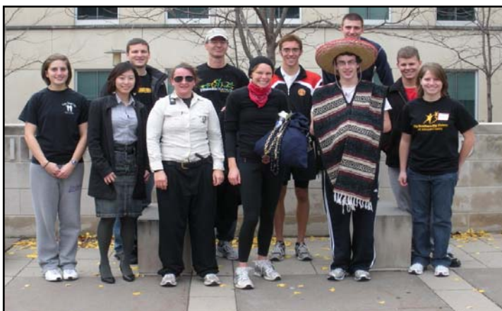
Left: A mixture of volunteers and runners at the 6th annual Spooky Sprint 5K walk-run on November 1, 2009.