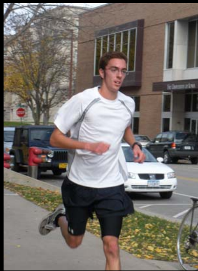
Above: The Race Winner Crosses the Finish Line Outside the Seamans Center

For the sixth consecutive year the University of Iowa's American Institute of Chemical Engineers Student Chapter hosted the Spooky Sprint 5k Race/Costume contest. The race was a 5k run/walk that was held on November 1 st 2009. The money raised from philanthropic event benefited the Johnson County Shelter House. The Johnson County Shelter House is a non-profit organization that has provided housing and supportive services to the homeless of Southeast Iowa since 1983. The shelter house has provided support and transitional housing to men, women and children, the elderly, and the disabled.