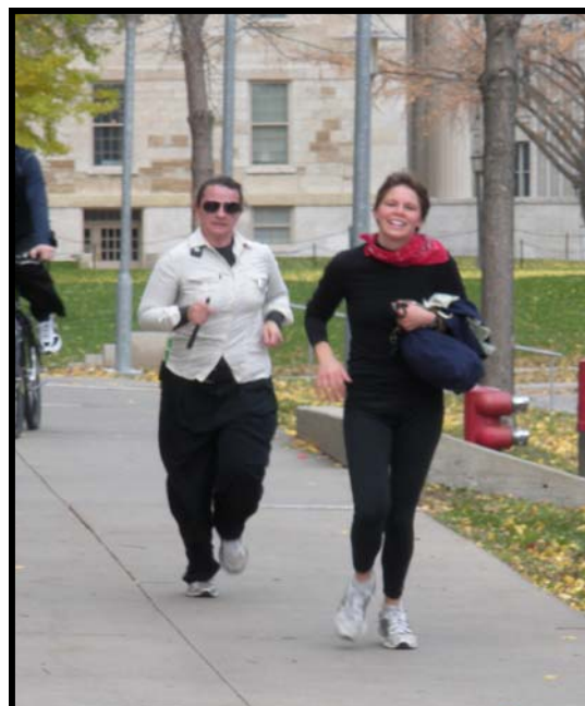
Above: Runners Race to the Finish Line in their Halloween Costumes

The 2009 spooky sprint had a good number of sponsors, as well as runners participating in the event. The prizes given to the runners and the fruits and water for them after the race were all donated by local businesses of Iowa City and Coralville. The year the race raised $430 dollars thanks to the runners and donations from the community. Other donations such as bottled water and clothes were also given to the shelter house. For more information about the Johnson County Shelter House or the Spooky Sprint, please visit www.shelterhouseiowa.org and www.engineering.uiowa.edu/~aiche respectively.